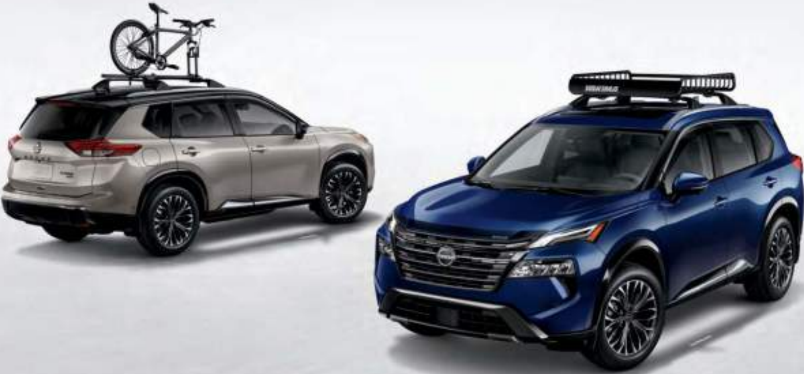
Rear/Left: Nissan Rogue® Platinum AWD shown in Two-tone Champagne Silver Metallic / Super Black 6 with Exterior Ground Lighting w/ Logo, Side-Window Deflectors (4-piece set), Satin Chrome Rear Bumper Protector, Splash Guards (4-piece set), Roof Rail Crossbars, 1, 35 and Affiliated: Yakima® ForkLift — Fork Mount Bike Rack. 1, 33 Front/Right: Nissan Rogue® Platinum AWD shown in Deep Ocean Blue Metallic with Exterior Ground Lighting w/ Logo, Hood Wind Deflector, Side-Window Deflectors (4-piece set), Splash Guards (4-piece set), Roof Rail Crossbars, 1, 35 and Affiliated: Yakima® LoadWarrior — Cargo Basket. 1, 33

For more information and to shop online for Rogue Genuine Nissan Accessories, go to bit.ly/24Rogue-Accys