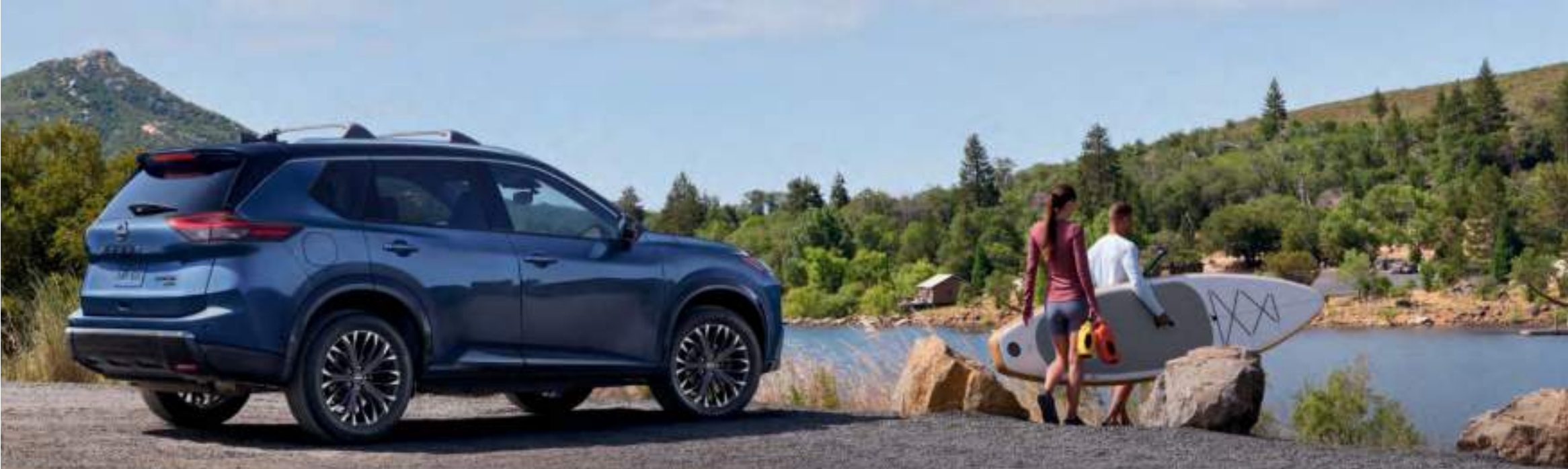
Nissan Rogue ® Platinum AWD shown in Scarlet Ember Tintcoat 6 with optional equipment. Nissan Rogue ® Platinum AWD shown in Two-tone Deep Ocean Blue Metallic / Super Black 6 with optional equipment.