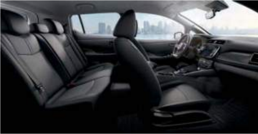
Black Cloth S | SV PLUS