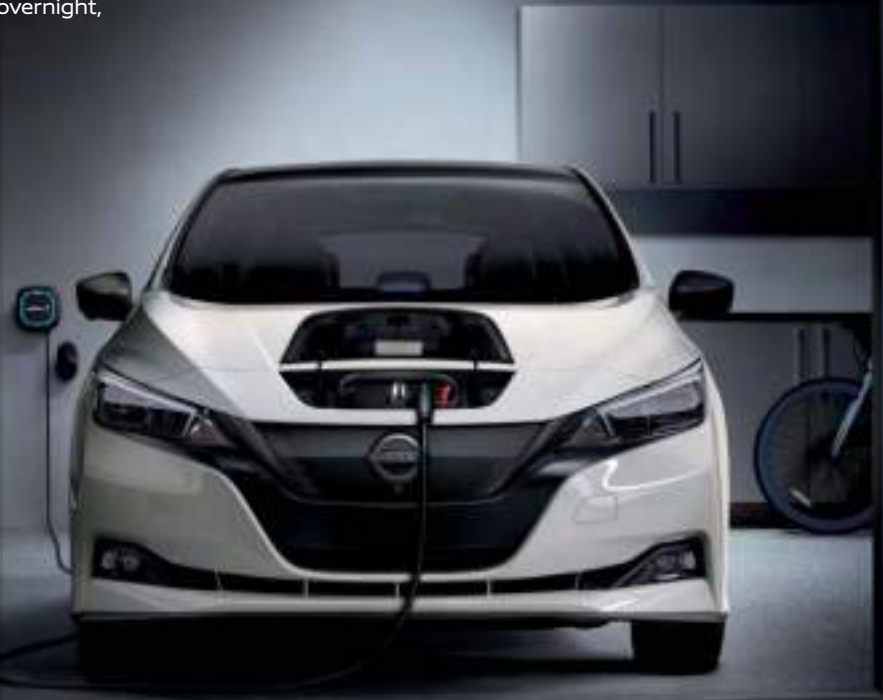
EPA-estimated range up to 212 miles as shown on Nissan LEAF® SV PLUS. 1

60 kWh Battery: EPA-estimated Range up to 212 Miles on Nissan LEAF SV PLUS 1 Approx. 11 Hours = Full Charge 19 40 kWh Battery: EPA-estimated Range up to 149 Miles on Nissan LEAF S 1 Approx. 7 Hours & 45 Minutes = Full Charge 19