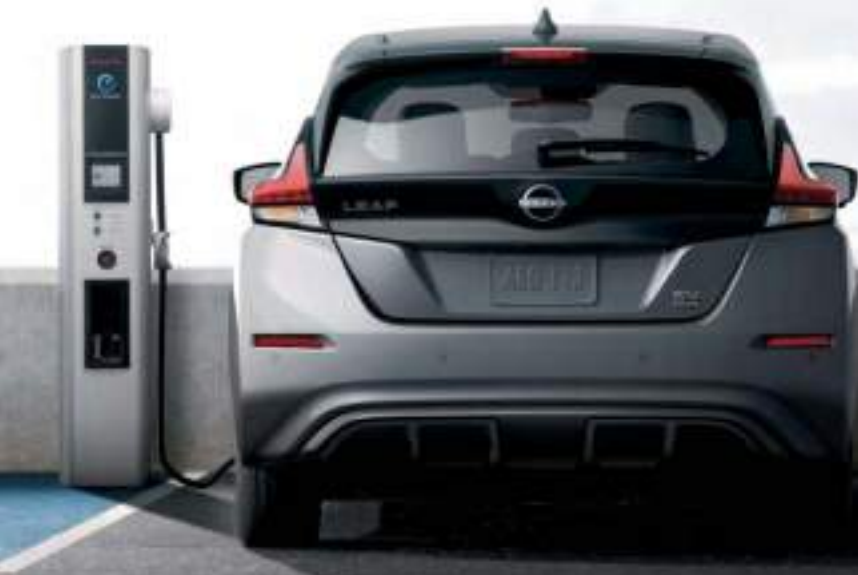
EPA-estimated range up to 212 miles as shown on Nissan LEAF® SV PLUS. 1

An ever-expanding network of public EV charging stations means you’ve got a lot of options for your next charge. Just use the available menu on your Nissan LEAF’s center touch-screen display — you can even filter for the type of charger you are looking for, type of payment method, and more. 6, 21