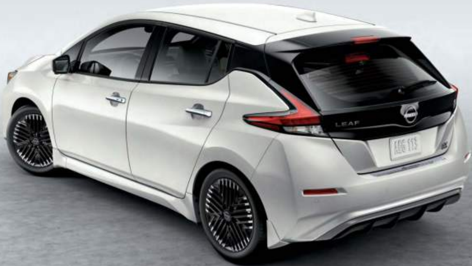
Nissan LEAF® SV PLUS shown in Pearl White TriCoat 3 with Chrome Rear Bumper Protector and Splash Guards.

For more information and to shop online for Nissan LEAF® Genuine Nissan Accessories, go to bit.ly/24Leaf-Accys