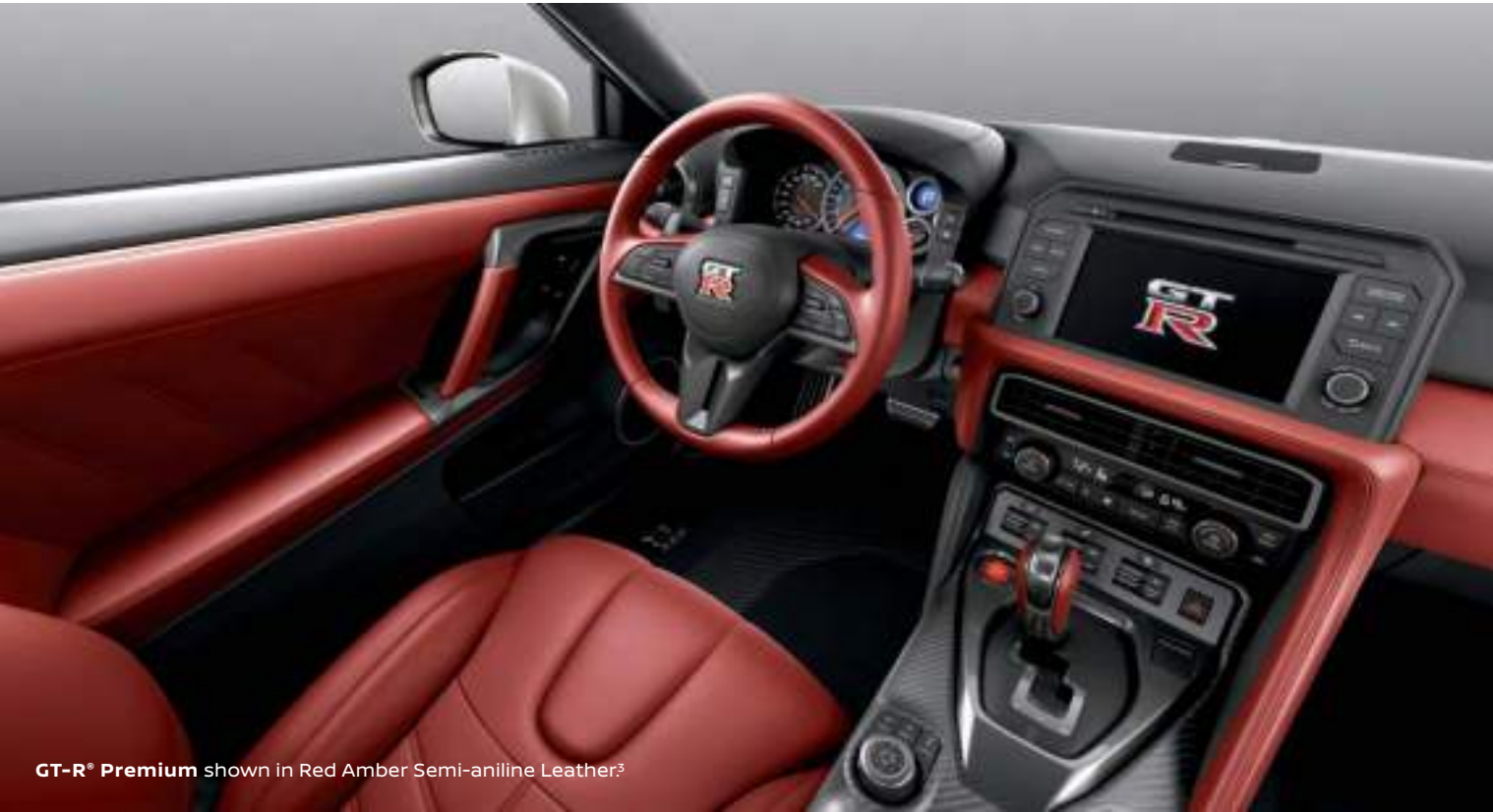
GT-R ® Premium shown in Red Amber Semi-aniline Leather. 3